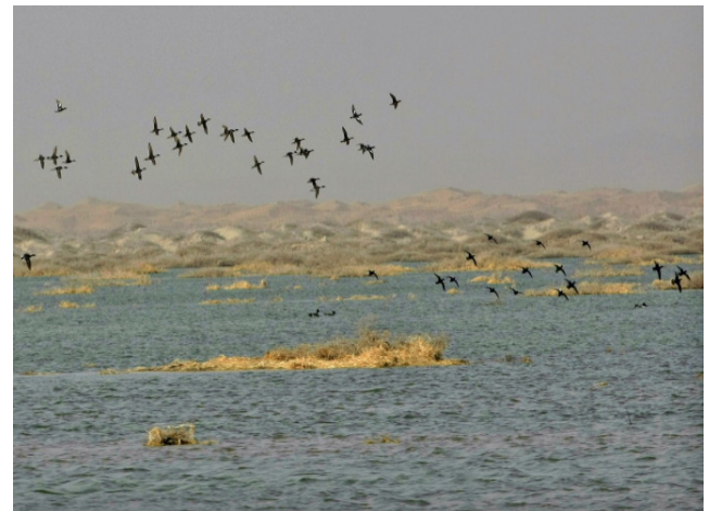
Figure 4. Qingtu lake after the key management of Shiyang River Basin.

change. According to the report of GanSu observatory, in 2012, the sand storm in Minqin settlement decreased, and there was no strong storm all over the year, and the times of sand storm was the least in recent years. In recent 50 years, the average occurrence times of sand storm in Shiyang river basin are 9 per year, and in Minqin are 26.7.[6]. In 2012, there was no sand storm, which is the lowest record since aerograph has been used. All this means the recovery of Qingtu lake has good effect on local environment and climate.