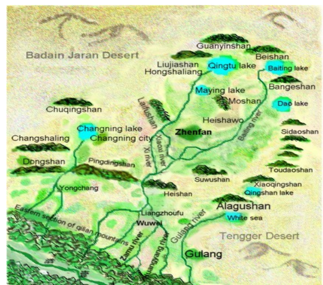
Figure 2. Simplified Constitution of Solid-plug Conveying Element.

In the prehistorian, the Minqin basin was called "ancient Yezhuze lake" with more than one hundred kilometers length and tens of kilometers width. Withdraw of inflow and silting, the ancient Yezhuze lake was separated into east and west part, and then continues to shrink into several small lakes. During 1360s-1840s, the downstream of Shiyang River was divided into Daxi River and Baiting River, and formed two terminal lake: Qingtu Lake and Baiting Lake (Figure 2)[4]. Till the end of 1890s, the Baiting River and Baiting Lake were vanished, and all the rest of Mingqin basin became bogs or wet lands except Dajing River and Qingtu Lake. At the beginning of the 20th century, Qingtu Lake, the terminal lake of Shiyang River was about 120 square kilometers, reedy and rippling. Following the growth of population and the development of irrigated agriculture in the Minqin basin the water area of Qingtu Lake kept on shrinking. During the late 1940s, the water area was only 70 square kilometer. In the 1950s, the water area shrunk faster[4]. In 1959, with construction of Hongyashan dam, the inflow of Daxi River was cut off, making the Qingtu Lake dried up (figure 3).