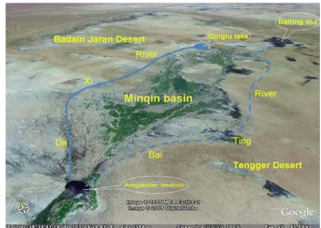
Figure 5. The downstream branch is proposed to restore in Shiyang River Basin.

With respect to the governance of Shiyang River in recent years, only the ecological recovery of Qingtu Lake by supplying water is taken into consideration. However, the